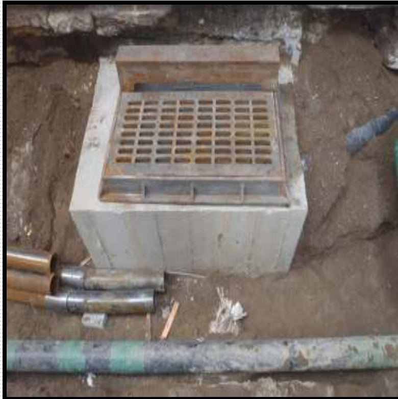
Installation of New Catch Basins

RECONSTRUCTION OF FULTON ST PHASE II Project ID: HMMWTCA8B