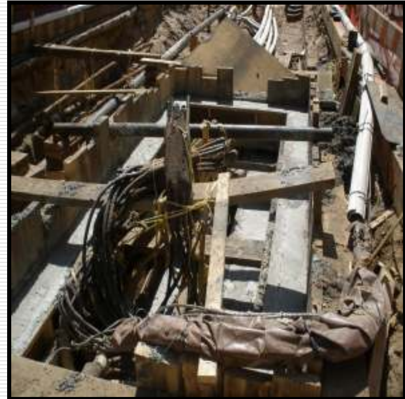
Construction of Con Edison Manhole