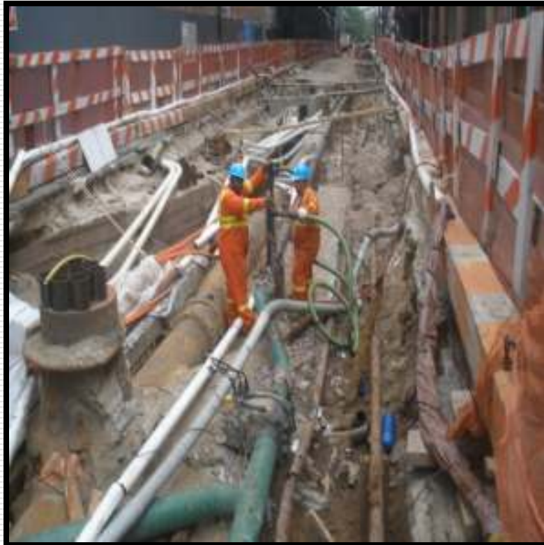
Con Edison Gas Main Replacement