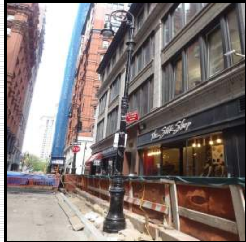
Replacement of Street Light Poles

RECONSTRUCTION OF FULTON ST PHASE II Project ID: HMMWTCA8B